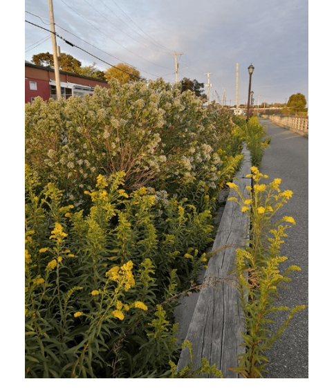
Commercial Street rain garden, Salem.