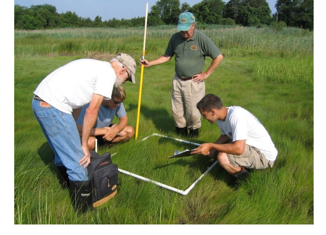
Bridge Creek monitoring by volunteers in 2005